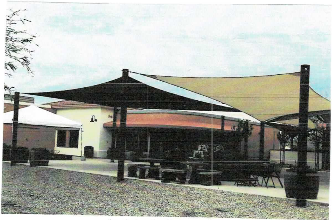
Posada Java Outside Courtyard